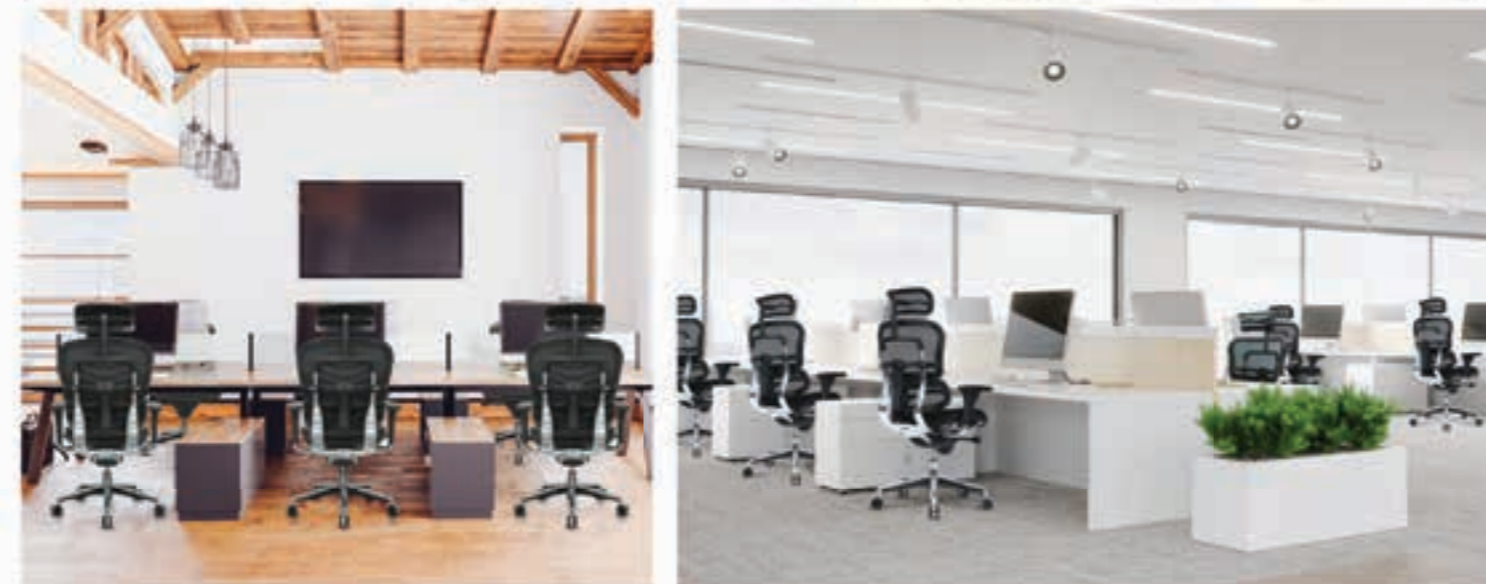
CLOCKWISE FROM TOP LEFT: ME7ERG, FME11ERG, FME11ERG, LE9ERG COVER IMAGE: ME7ERG